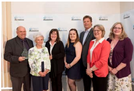
Renfrew & Area Senior Home Support Inc. President's Award