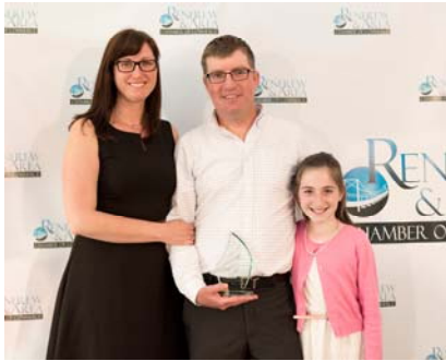
Valley Guiding and Outfitting New Business Award