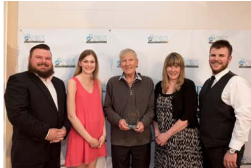
Scott's Shoe Store BIA Member of the Year