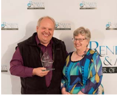
Scott & Sons Hardware Ltd. Outstanding Business Achievement

photos courtesy of "Kelly Cobus Photography"