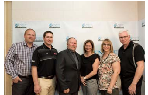
Deslaurier Custom Cabinets Industry of the Year