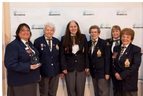
Renfrew Legion Ladies Auxilliary Community Champion of the Year