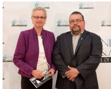
Renfrew Agricultural Society Agri-Business of the Year