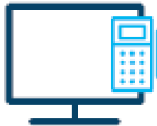
Integrated POS Solutions